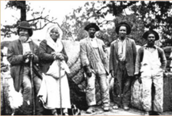
African American slaves on the Turnwold Plantation, n.d.