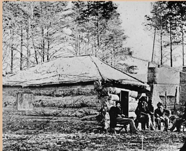
Civil War soldiers, probably Union occupation troops, in winter quarters, Georgia, ca. 1864 (detail)

“All dis time de rain wuz a-siftin' down. It fall mighty soft, but 'twuz monst'ous wet, suh. Bimeby I crope up nigher de aidge, en w'en de man see me he holler out, 'Hol' on, aunty; don't you fall down yer!”