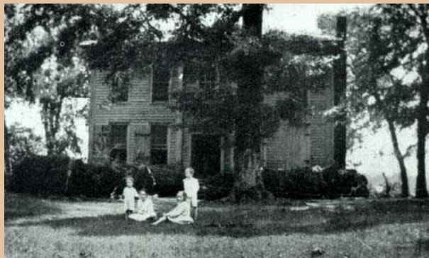
Turnwold Plantation, near Eatonton, Georgia, on which Harris worked during the Civil War, and which he used as the model for the Tomlinson house, n.d.

I think my grandmother used to go to church to see what kind of clothes Harriet Bledsoe wore; for I have often heard her say, after the sermon was over, that Harriet's bonnet, or Harriet's dress, was perfectly charming. Certainly Mrs. Tomlinson was always dressed in the height of fashion, though it was a very simple fashion when compared with the flounces and furbelows of her neighbors. I remember this distinctly, that she seemed to be perfectly cool the hottest Sunday in summer, and comfortably warm the coldest Sunday in winter; and I am convinced that this impression, made on the mind of a child, must bear some definite relation to Mrs. Tomlinson's good taste.