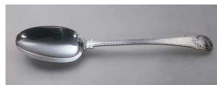
silver spoon by Paul Revere, ca. 1770s Metropolitan Museum of Art

"But mark how Luxury will enter Families"