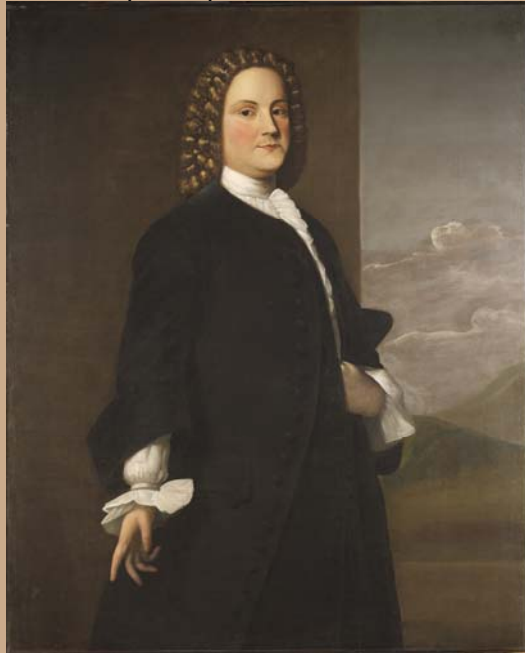
Earliest known portrait of Benjamin Franklin, ca. 1746; oil on canvas, by Robert Feke

Franklin commissioned this portrait of himself in his early forties as he ended his first career as a printer, from which he had built a small fortune. Wearing a dark green velvet coat, a silk shirt with ruffled sleeves, and a brown wig, he dresses in the fashion of a gentleman, understated yet conveying a clear aspiration to join the political and economic elite of Philadelphia. 1