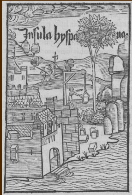
"Insula hyspana": Spanish islands, with a fortified settlement, 1494