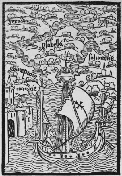
Caribbean islands named by Columbus, 1493: Ferna[n]da, Hyspana, Isabella, Salvatorie, and Conceptoio[n]e marie