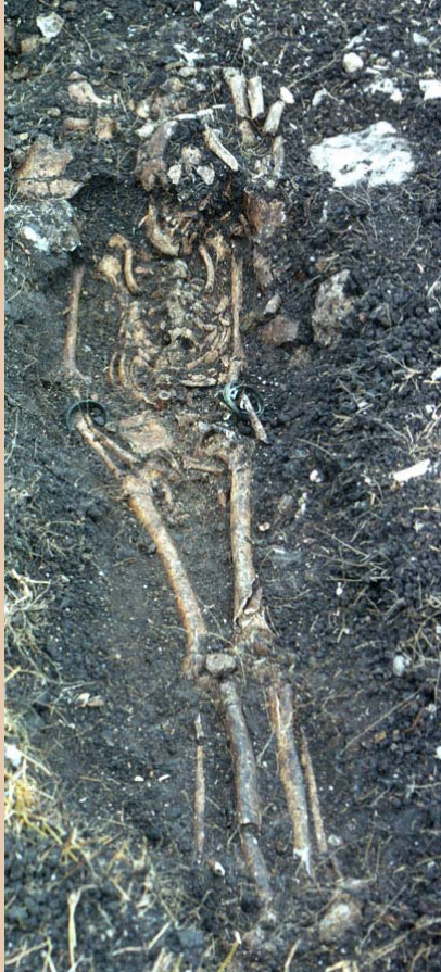
Skeleton, perhaps of an "Obeah man," (medicine man) wearing metal bracelets on each arm