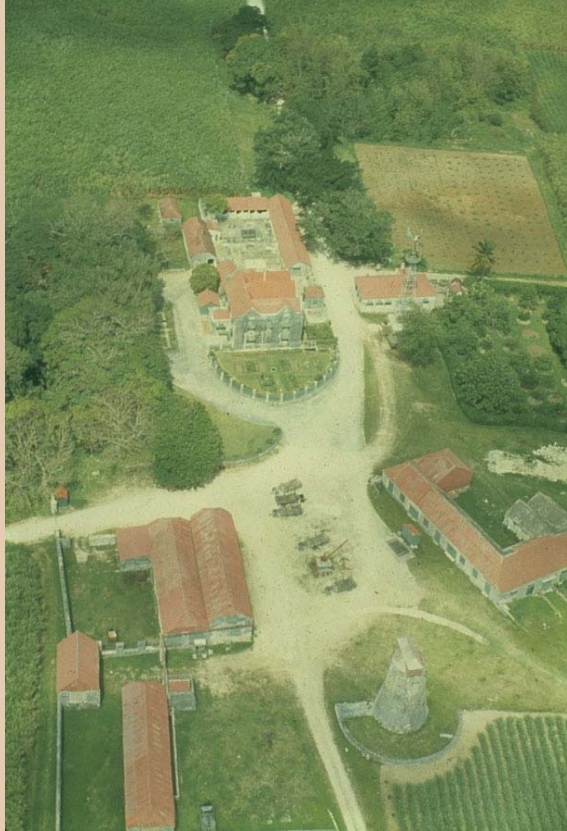
Drax Hall Plantation, Barbados, constructed in the 1650s (photographs, 1970s)