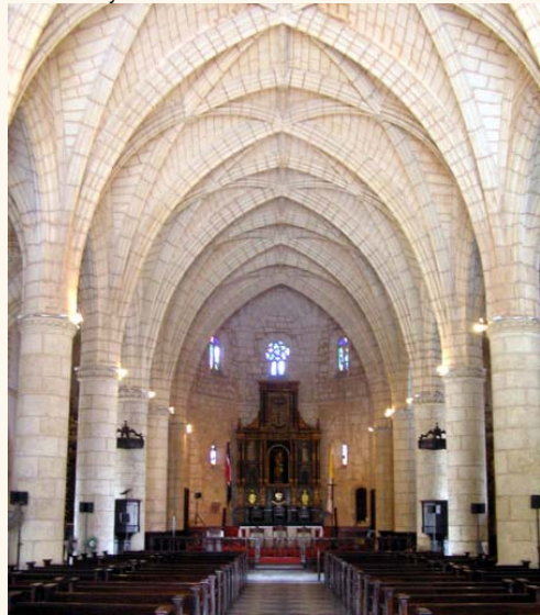
Cathedral of Santa Maria de Menor, constructed 1514-1544, Santo Domingo, Dominican Republic