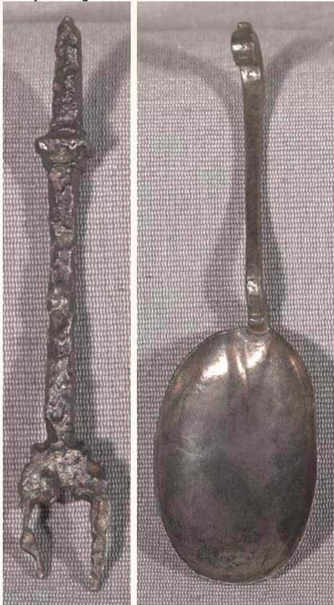
Silver utensils from the Spanish galleon Nuestra Señora de Atocha , wrecked on the Florida coral reefs near the Dry Tortugas in 1622

hundred years before, in the year 1588 vanished into smoke, to the great confusion and discouragement of the authors thereof.