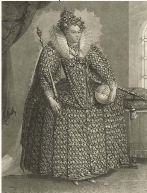
Queen Elizabeth I, "in the superb dress in which she went to St. Paul's to return thanks for the defeat of the Spanish Armada," engraving ca. 1840

he received was as follows:—That the Spaniards by their unfairness towards the English, whom they had prohibited from commerce, contrary to the right of nations, had brought these troubles upon themselves. . . . Her Majesty does not understand why her subjects and those of other Princes are prohibited from the Indies, which she could not persuade herself are the rightful property of Spain by donation of the Pope of Rome [1493 decree dividing the New World between Spain and Portugal] . . . and that only on the ground that Spaniards have touched here and there, have erected shelters, have given names to a river or promontory; acts which cannot confer property. So that this donation of alien property (which be essence of law is void) and this imaginary proprietorship ought not to hinder other princes from carrying on commerce in these regions, and from establishing Colonies where Spaniards are not residing, without the least violation of the law of nations.