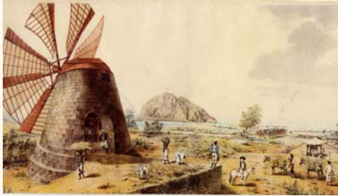
English sugar plantations in the Lesser Antilles above: St. Kitts (perhaps), late 1700s below: Nicholas Abbey plantation, Barbados, constructed 1650s