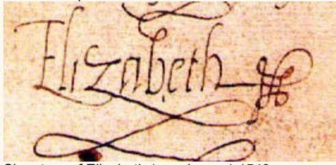
Signature of Elizabeth (as princess) 1549