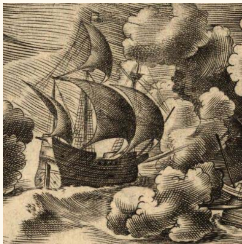
Diego Gutiérrez, map of the western hemisphere ( Americae sive quartae orbis ), 1562, details

not it would have been well had you learned what voyage the ship was making and what she carried, and had not let the master and men of said ship go (as go they did), and after they had landed and visited the city and seen how it lies, and its harbor, inasmuch as they were from a foreign kingdom, and this was a thing not heretofore experienced in those parts. Nor can you exonerate yourselves in the matter, for there was great carelessness and negligence.