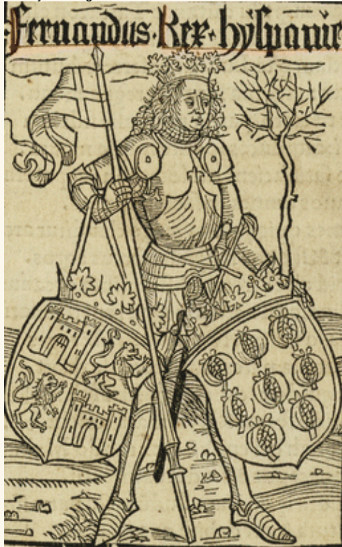
Ferdinand, King of Spain, woodcut by Carlo Verardi, 1494