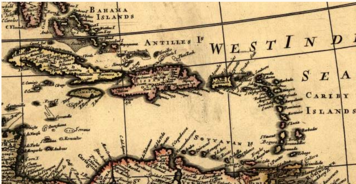
Philip Lea, North America divided into its III principall parts , 1685, detail