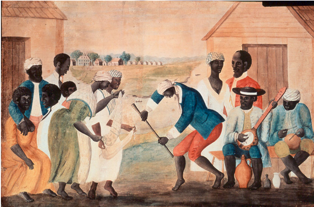
The Old Plantation, ca. 1800

Artist unknown. Watercolor on paper. Abby Aldrich Rockefeller Folk Art Museum. Colonial Williamsburg Foundation, Williamsburg, Virginia. Reproduced with permission.