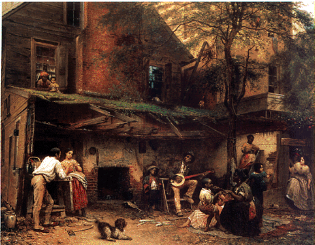
Eastman Johnson (1824-1906)

Artist unknown. Watercolor on paper. Abby Aldrich Rockefeller Folk Art Museum. Colonial Williamsburg Foundation, Williamsburg, Virginia. Reproduced with permission.