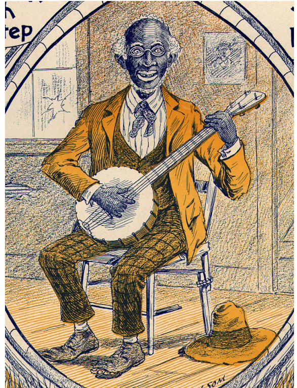
“Nicodemus and His Banjo”

Artist unknown. Lithograph, ca. 1875 (cropped)