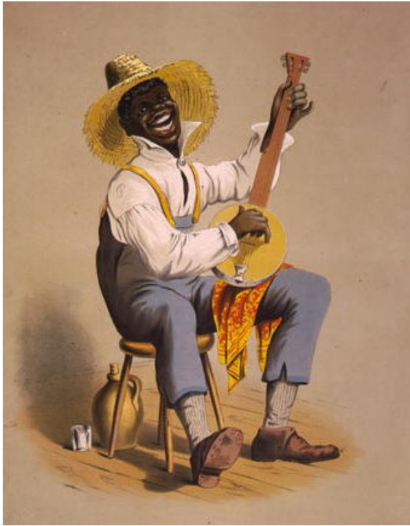
“Plantation Banjo Player”

Artist unknown. Lithograph, ca. 1875 (cropped)