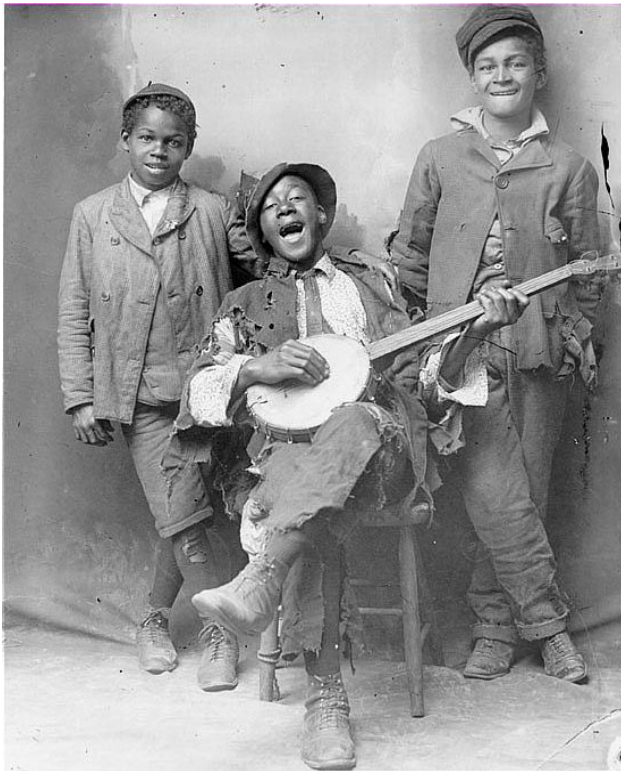
“Boys with Banjo,” photograph, 1880s

E. Asher. Sheet music cover, 1899 (detail)