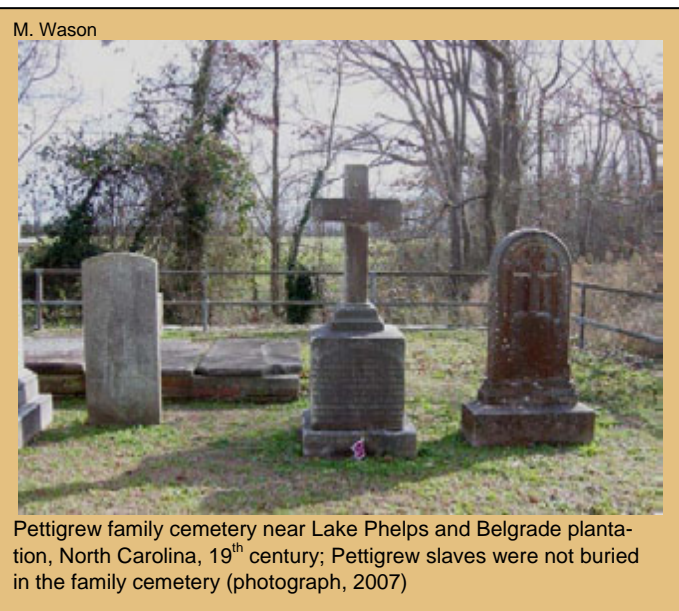
M. Wason Pettigrew family cemetery near Lake Phelps and Belgrade plantation, North Carolina, 19 th century; Pettigrew slaves were not buried in the family cemetery (photograph, 2007)