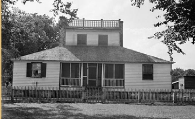
Magnolia plantation house, Washington County, eastern North Carolina, built ca. 1830 (photograph, 1940); house no longer standing