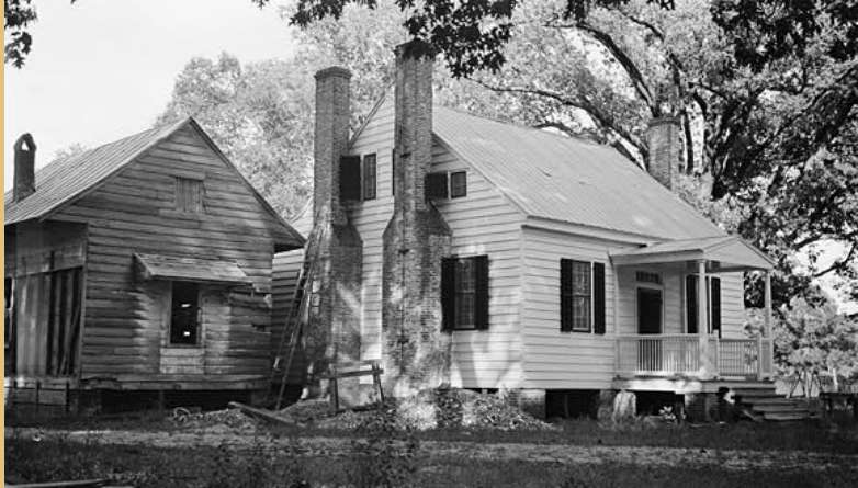
Belgrade plantation house, Washington County, eastern North Carolina, built ca. 1800 (photograph, 1940); house no longer standing

Bee tree canal but we saw master Charles and he told us to not clean it out yet an so we held hol-ladays 3 days master an I went in the ten foot ditch to cleaning that out . the people has been veary well behaved since master left as could be expected master to me an has