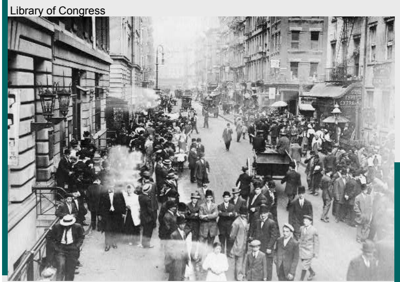
"Celebrating the Jewish New Year on the East Side of New York," between 1905 and 1915

The courses of study I had to swallow to get my diploma were utterly barren of interest to me. I didn't come to college to get dull learning from dead books. I didn't come for that dry, inanimate stuff that can be hammered out in lectures. I came because I longed for the larger life, for the stimulus of intellectual associations. I came because my whole being clamored for more vision, more light. But everywhere I went I saw big fences put up against me, with the brutal signs: "No trespassing. Get off the grass."