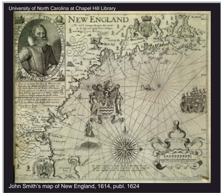
John Smith's map of New England, 1614, publ. 1624

§ 6. . . instead of reciting the many Adventures of the English to visit these Parts of the World, I shall but repeat the Words of one Captain [George] Weymouth , an Historian , as well as an Undertaker [participant]