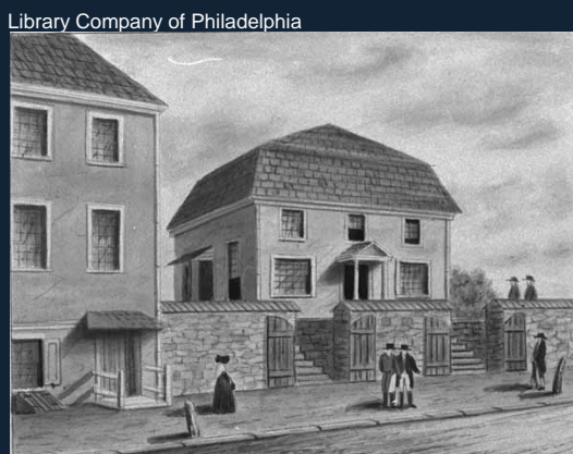
Friends' Bank Meeting, Philadelphia, built 1685

"Lots are much desir'd in the Town, great buying one of another."