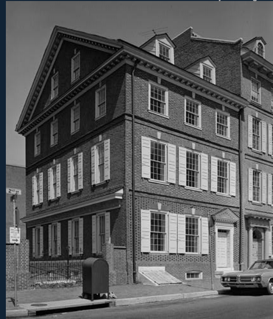
Samuel Neave House, mid 1700s (photographs, 1972)