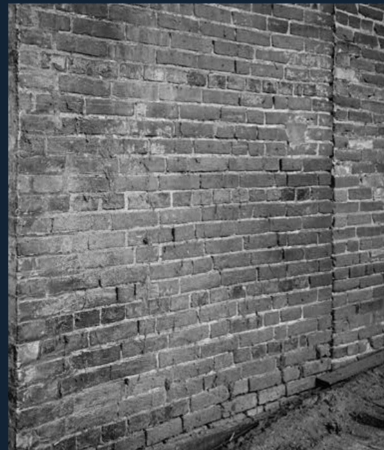
Brick wall of a backbuilding of the Samuel Neave House. Note from the Historic American Buildings Survey, Library of Congress: "Note glazed (black) header courses laid generally one in six courses (common bond), although slight variation is visible; stretchers are red, producing a striped wall. Note also the loose bonding of brick."