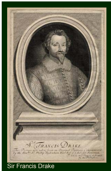
Sir Francis Drake

Whose zeal is strong, whose practice true, whose faith is void of fear, If any such there be, inflamed with holy care. Here may he find, a ready mean, his purpose to declare: So that, for each degree, this Treatise doth unfold: The path to Fame, the proof of zeal, and way to purchase gold.