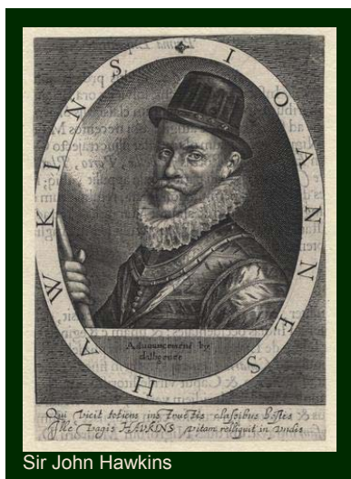
Sir John Hawkins