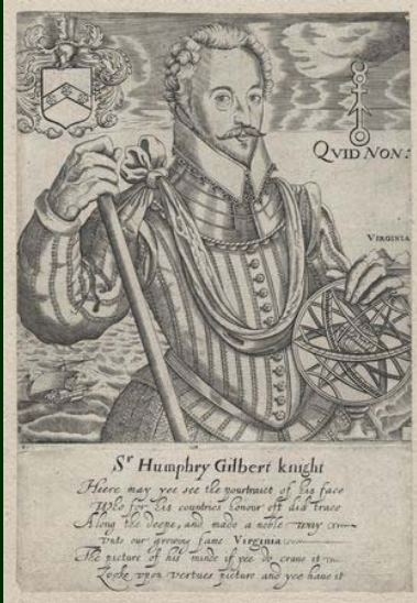
Sir Humphrey Gilbert