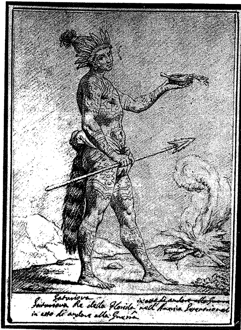
Chief Satouriona, from an ancient drawing by an unidentified artist, on display at the Fort Caroline National Memorial.

monies and embarked a boats that b he had arriv from the vi assembled l of the chief: forces and v of their ene: rest of the c quietly as pe by water and the village t to pieces, ex