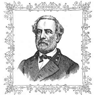
Robert E. Lee